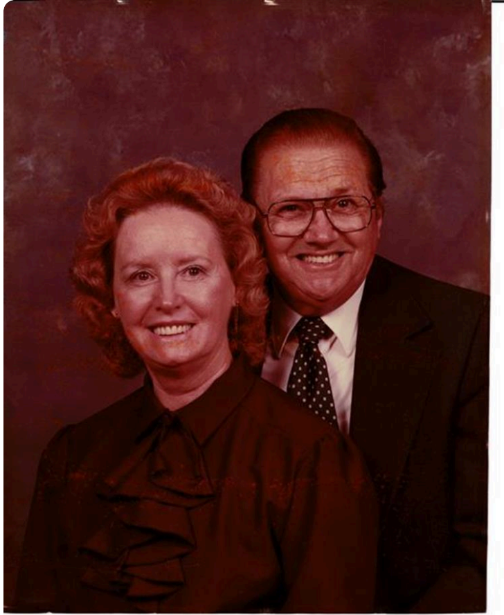
Grandma & Grandpa Petty